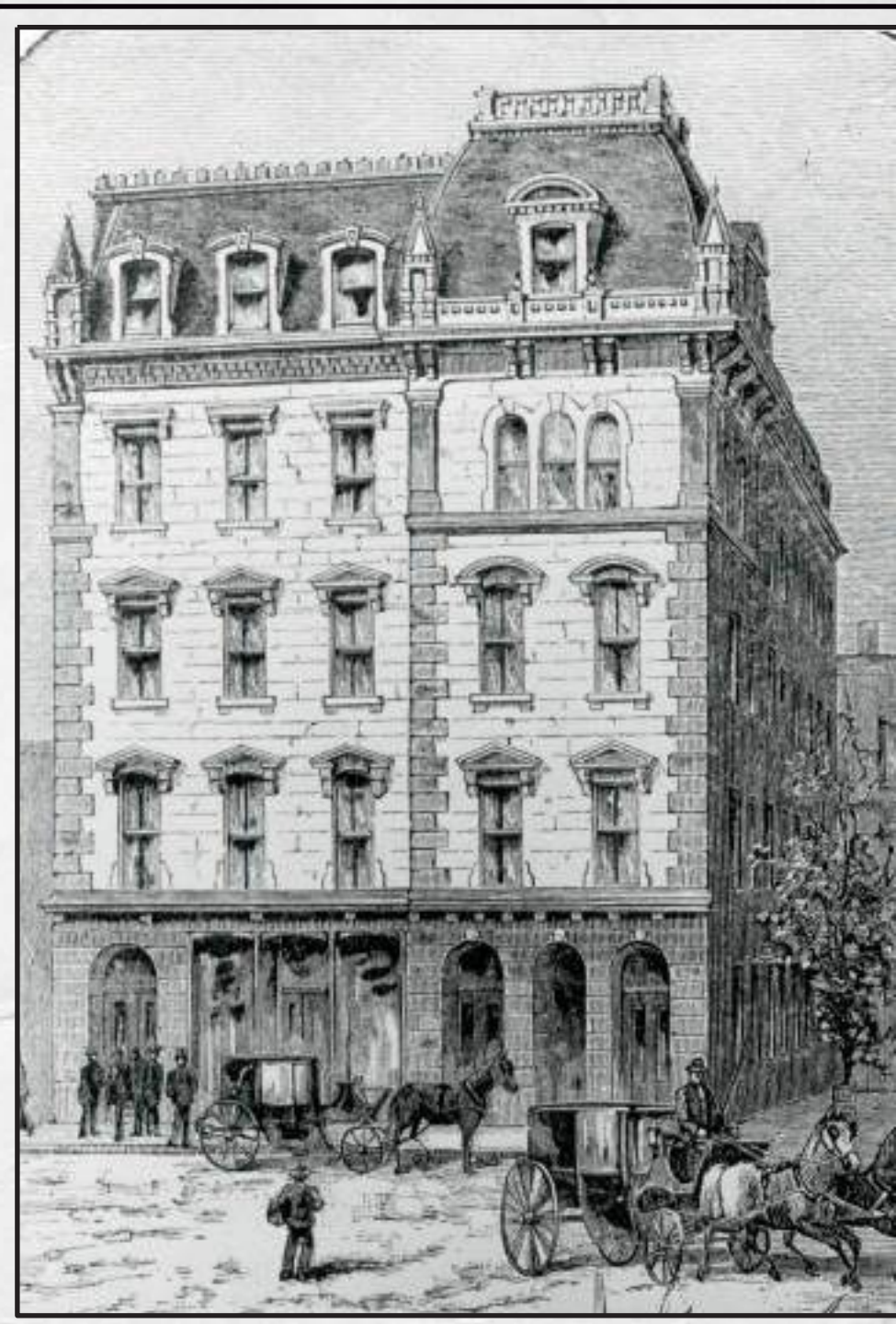
Freedman's Bank Circa 1879