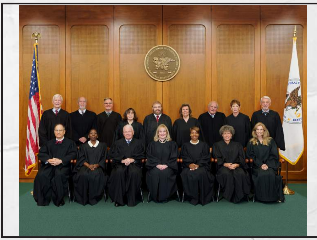
Judges of the U.S. Court of Federal Claims 2018

evertheless, despite the nature of the claim, the notability of the claimant, or the amount in dispute, the Court of Federal Claims acts as a clearing house where the government must settle up with those it has legally wronged. As observed by former Chief Judge Loren A. Smith, the Court is the institutional scale that weighs the government's actions against the standard measure of the law and helps make concrete the spirit of the First Amendment's guarantee of the right "to petition the Government for redress of grievances."