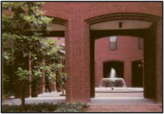
Courtyard of National Courts Building

Court was by right if the amount in dispute was over $3,000. The growth in government caused by and coinciding with World War I made the system unworkable, as the number of filed cases increased considerably. In 1925, legislation enacted by Congress at the request of the court created a separate trial division of seven commissioners and elevated the five judges to an appellate role. Initially, the trial commissioners would function as special masters in chancery and conduct formal proceedings either at the court's home in Washington, DC, or elsewhere in the United States in a court facility amenable to the parties. The trial procedures evolved to resemble a non-jury civil trial in district court.